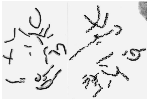
Fig. 2. SCEs in an untreated CHO-HSVtk + mitosis (left) and in a mitosis from a culture of the same cell line but treated with 0.1 \mu M GCV for the duration of one cell cycle (14 h) and prepared 28 h thereafter (right). The untreated cell shows seven SCEs recognizable by the change of the staining pattern to the opposite sister chromatid, while the GCV-treated mitosis contains 146 SCEs (fluorescence-plus-Giemsa staining).

where the frequency of micronucleus-containing poly- and normochromatic erythrocytes is evaluated after administration of the test agent to the animals. It is one of the few screening tests, which are accessible to automated image analysis.